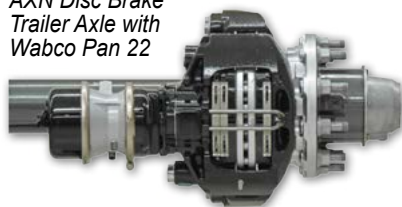
▶ AXN Disc Brake Trailer Axle with Wabco Pan 22