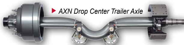
▶ AXN Drop Center Trailer Axle