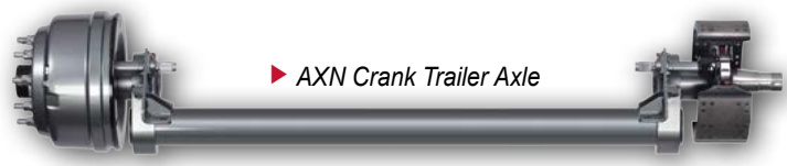
▶ AXN Crank Trailer Axle