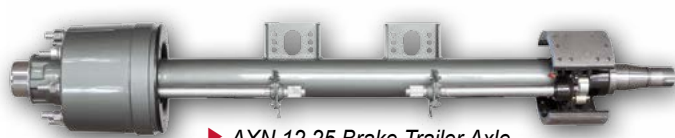
▶ AXN 12.25 Brake Trailer Axle

* See AXN Warranty Statement for details.